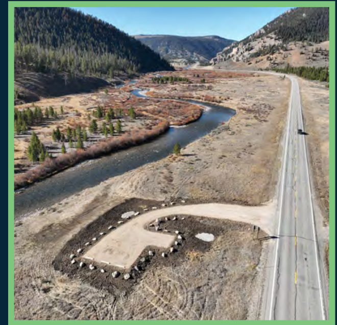
Restoration work and improved public access on the Park Boundary to Covered Wagon Ranch Project.

The Task Force's mission is to ensure a clean, healthy, and resilient Gallatin River for future generations while balancing conservation with public access for recreation and community growth. In 2025, they were awarded a $35,000 grant for their Education and Outreach Program and Park Boundary to Covered Wagon Ranch Restoration Project.