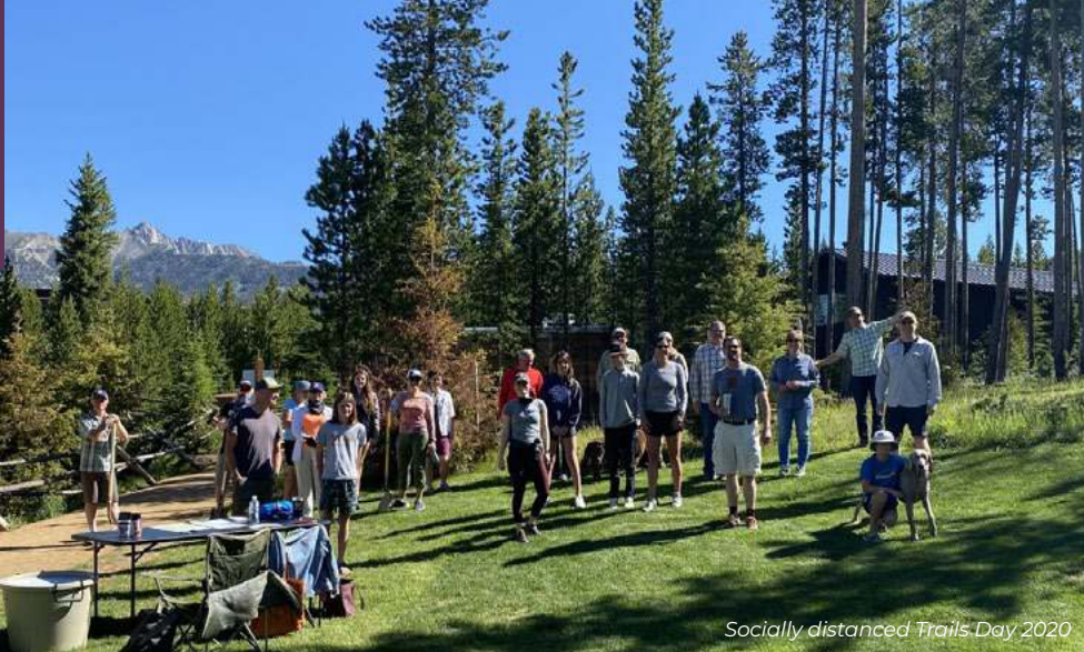
Socially distanced Trails Day 2020